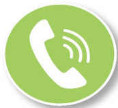
Phone (Home, cell or both)