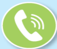
Phone (Home, cell or both)

Use the SchoolMessenger app and website so that you receive messages in one or more of these ways: