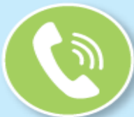
Phone (Home, cell or both)

Use the SchoolMessenger app and website so that you receive messages in one or more of these ways: